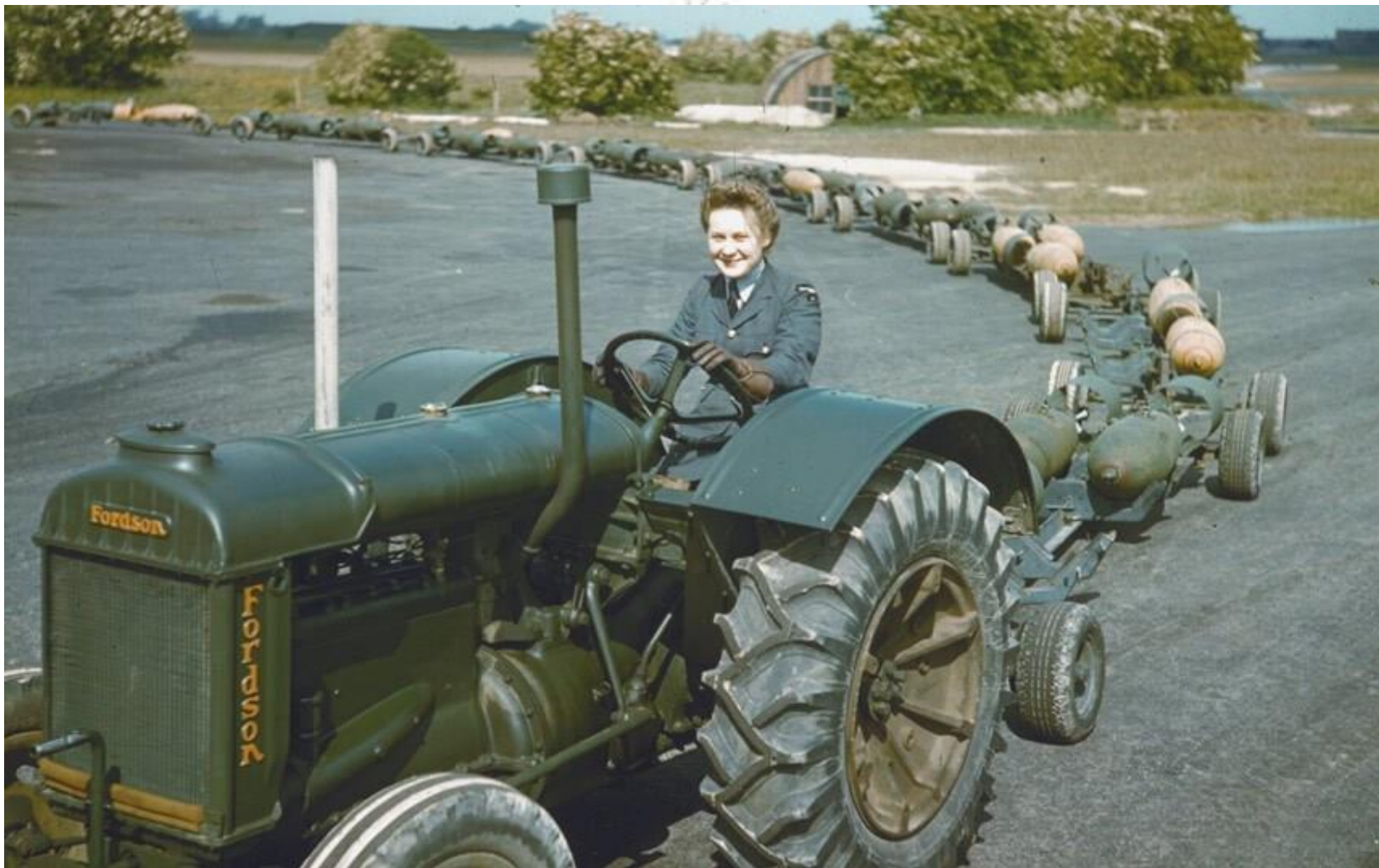
A WAAF tractor driver with a train of full bomb trolleys, RAF Mildenhall 1942.